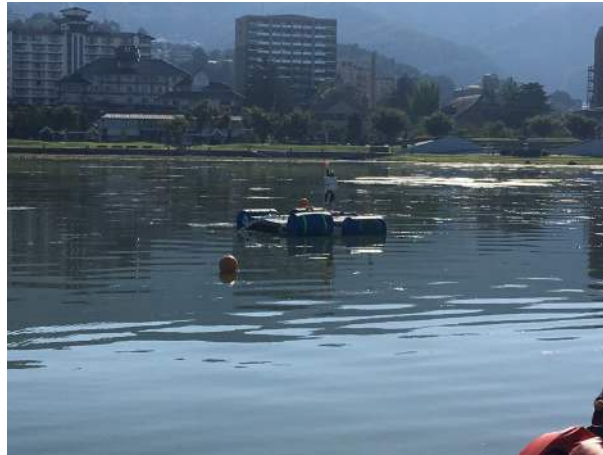
Floating platform holding Nanobubble unit

A specially designed water robot drone was placed on the bed of the lake to monitor the impact of the Nanobubbles on the sludge and data was sent back to computers and projected onto a large LED display panel, all housed on a floating observation barge. A dissolved oxygen instrument was installed below the barge.